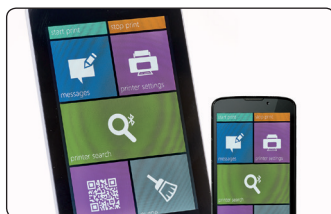
App works on Android