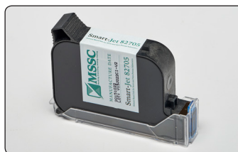
HP TIJ 2.5 technology