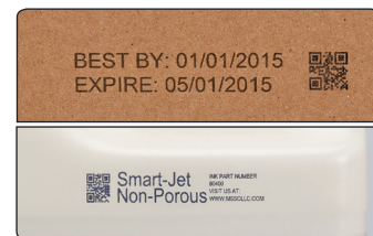
Porous and non-porous print