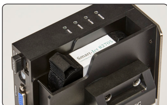
Redesigned Printer Head